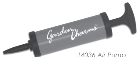
14036 Air Pump Sold Separately