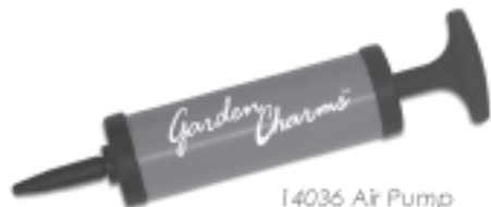
14036 Air Pump Sold Separately

Lift streamers for access to Inflation Nozzle