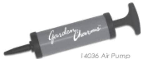
14036 Air Pump Sold Separately

Inflate this air bag second. Inflation Nozzle is located behind the Velcro Closure.